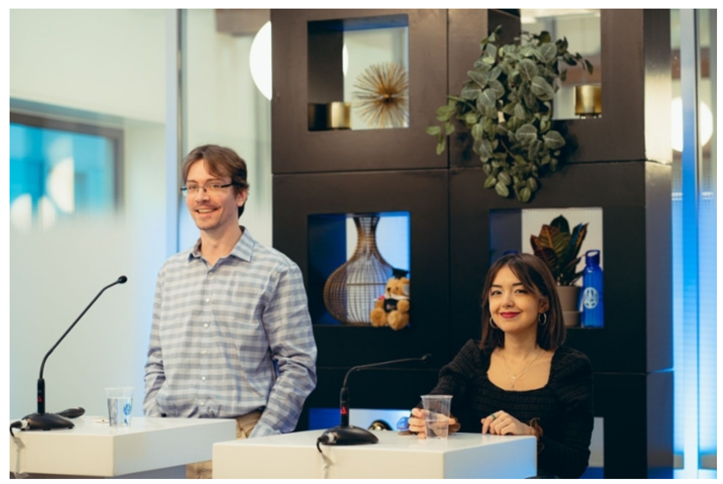
Two speakers at the open day

Are you thinking about joining this Master's programme, and want to determine if it will be the right fit for you? Below, you can browse the events that we have coming up, and sign up to experience Leiden University and the programme for yourself. Alternatively, take a look at the Master Talks videos to find out more about the programme or check out our virtual campus tours!