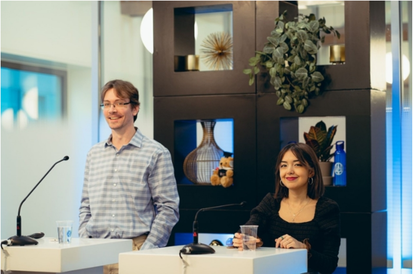
Two speakers at the open day

Are you thinking about joining this Master's programme, and want to determine if it will be the right fit for you? Below, you can browse the events that we have coming up, and sign up to experience Leiden University and the programme for yourself. Alternatively, take a look at the Master Talks videos to find out more about the programme or check out our virtual campus tours!