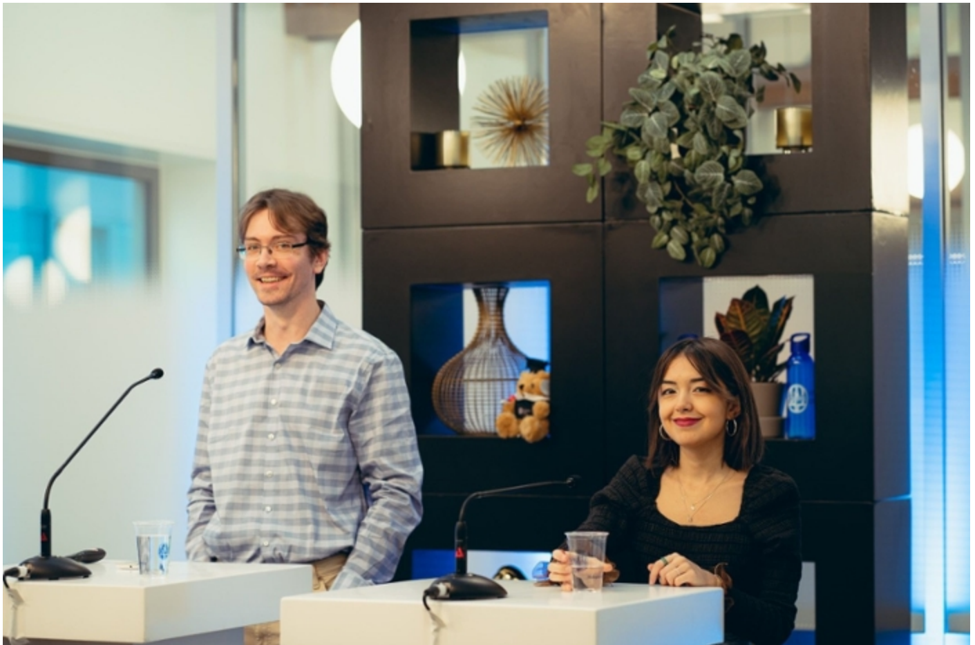
Two speakers at the open day

Are you thinking about joining this Master's programme, and want to determine if it will be the right fit for you? Below, you can browse the events that we have coming up, and sign up to experience Leiden University and the programme for yourself. Alternatively, take a look at the Master Talks videos to find out more about the programme or check out our virtual campus tours!