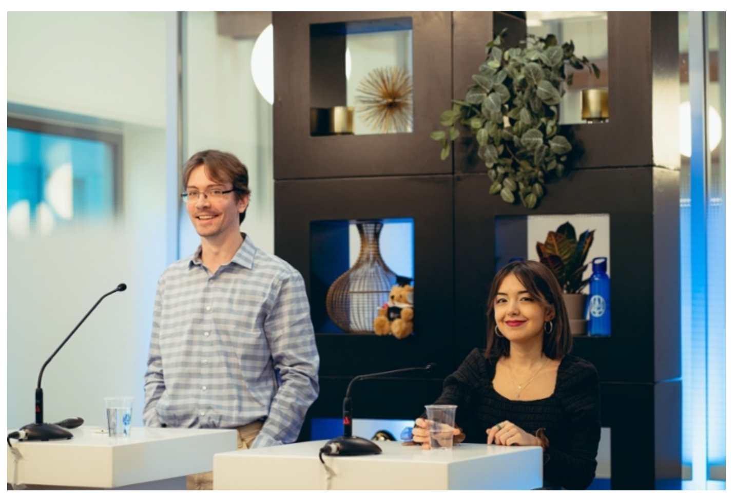
Two speakers at the open day

Get to know us through our online and in-person events for prospective students!