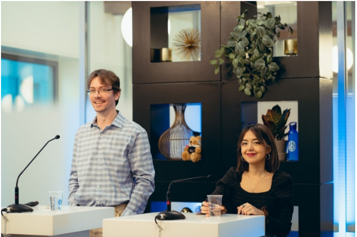
Two speakers at the open day

Are you thinking about joining this Master's programme, and want to determine if it will be the right fit for you? Below, you can browse the events that we have coming up, and sign up to experience Leiden University and the programme for yourself. Alternatively, take a look at the Master Talks videos to find out more about the programme or check out our virtual campus tours!