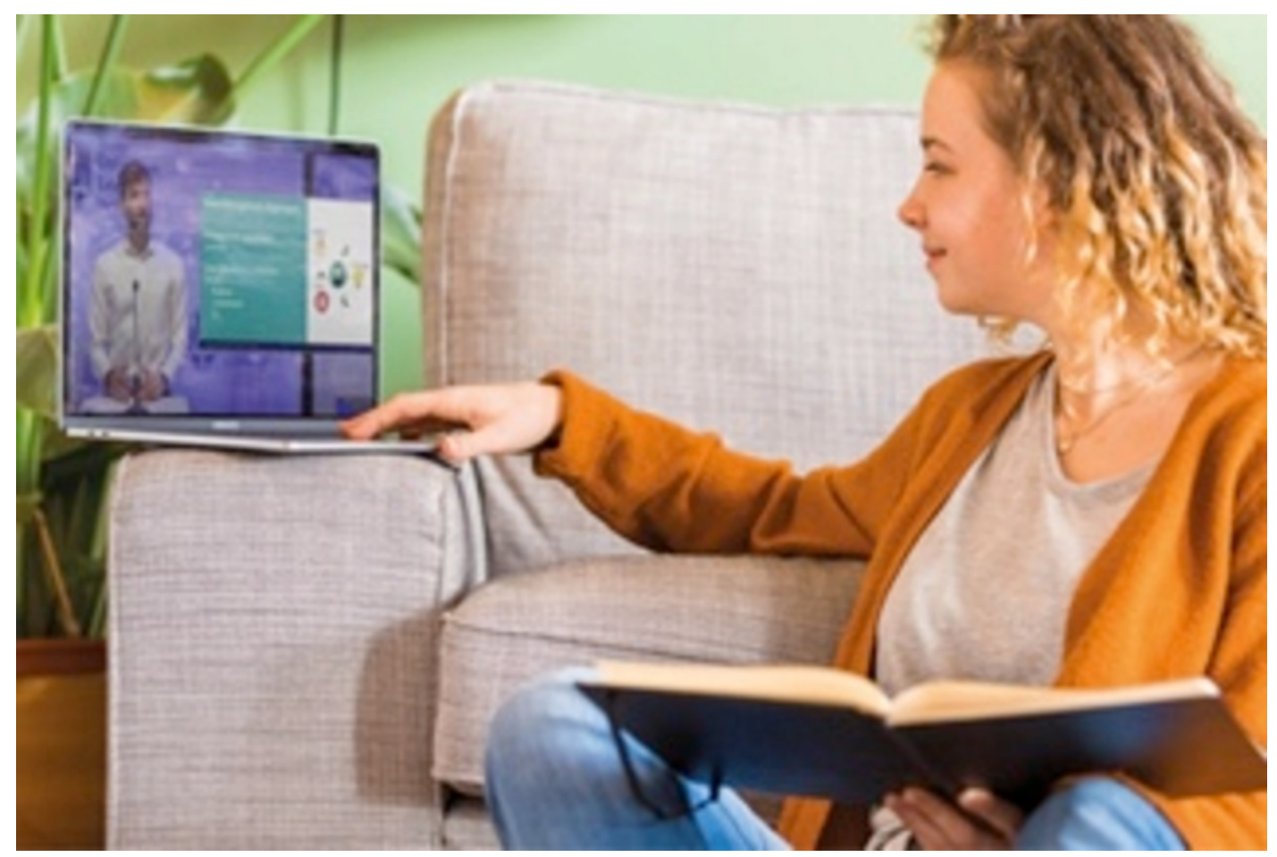
Student with laptop

Are you thinking about joining this Master's programme, and want to determine if it will be the right fit for you? Below, you can browse the events that we have coming up, and sign up to experience Leiden University and the programme for yourself. Alternatively, take a look at the Master Talks videos to find out more about the programme or check out our virtual campus tours!