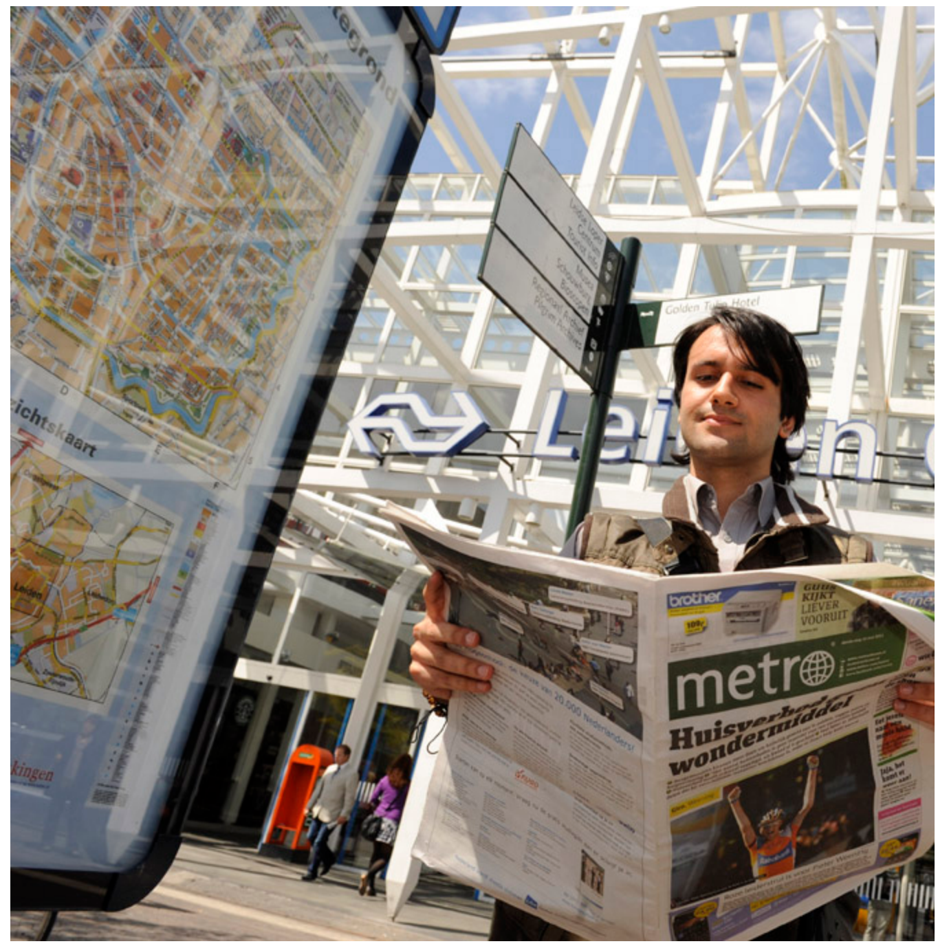
The city is located centrally between Netherland's biggest cities like Amsterdam, The Hague, Utrecht and Rotterdam, all easily reached by public transport.