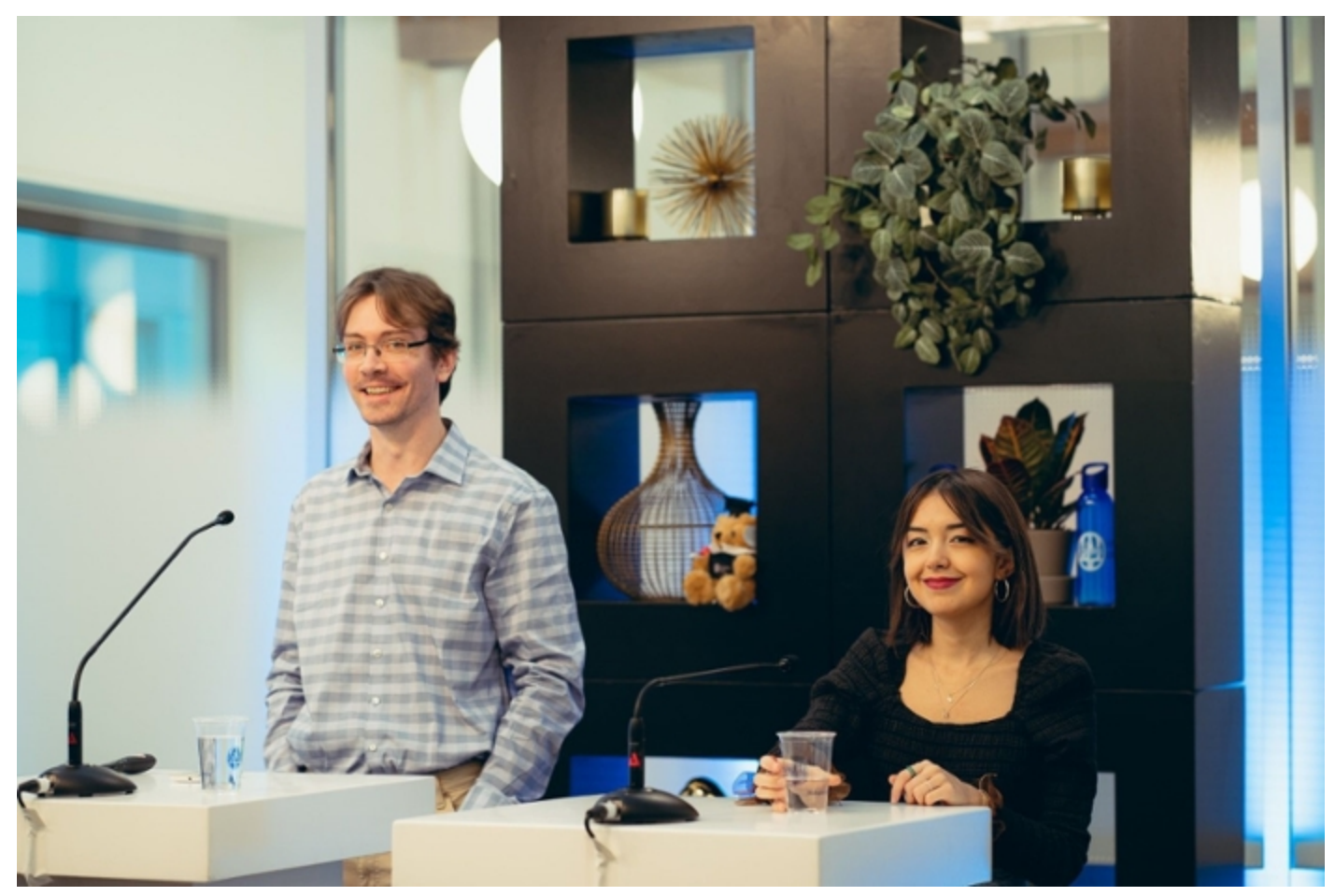
Two speakers at the open day

Are you thinking about joining this Master's programme, and want to determine if it will be the right fit for you? Below, you can browse the events that we have coming up, and sign up to experience Leiden University and the programme for yourself. Alternatively, take a look at the Master Talks videos to find out more about the programme or check out our virtual campus tours!