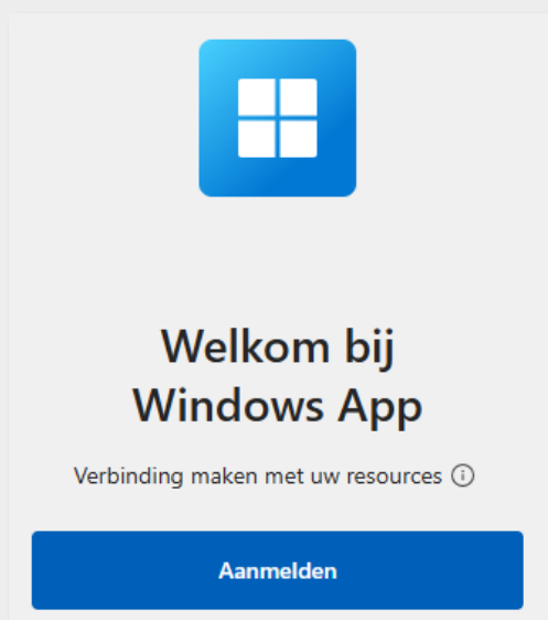
Login screen Windows app (Desktop)