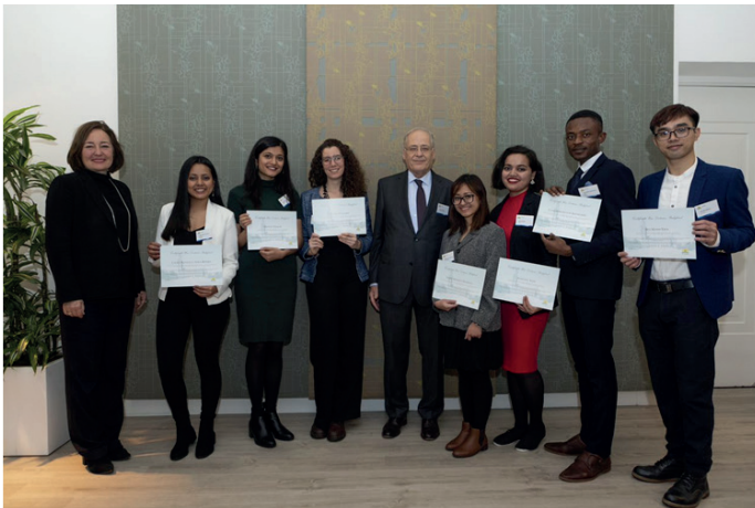
WDS Beneficiaries 2018

A total of € 95,000 remains unspent. In accordance with the objective as stipulated in Article 12(5) of the articles of association, this amount will be earmarked for activities that are in line with the objective of the Wim Deetman Studyfund Foundation. As a result, the remaining funds will be transferred to Nuffic and the foundation will subsequently be dissolved.