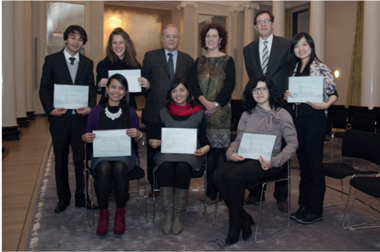
WDS Beneficiaries 2012