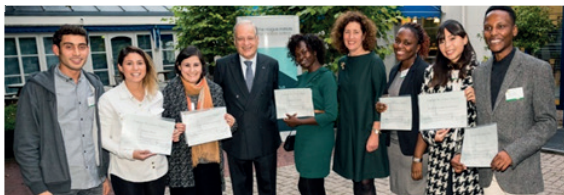
WDS Beneficiaries 2016

"Every time my friends or someone asks me how I managed to come to the Netherlands, I always bring the name of the great man Wim Deetman and his story and what he has done for us. It is unique that you can leave an impact for years and generations. He is a role model that everyone should follow to invest in education and young people. Whenever I tell the story to anyone, they say: 'Wow!'. I am proud of having received the scholarship, and I will live with it all my life, it is my beautiful story now."