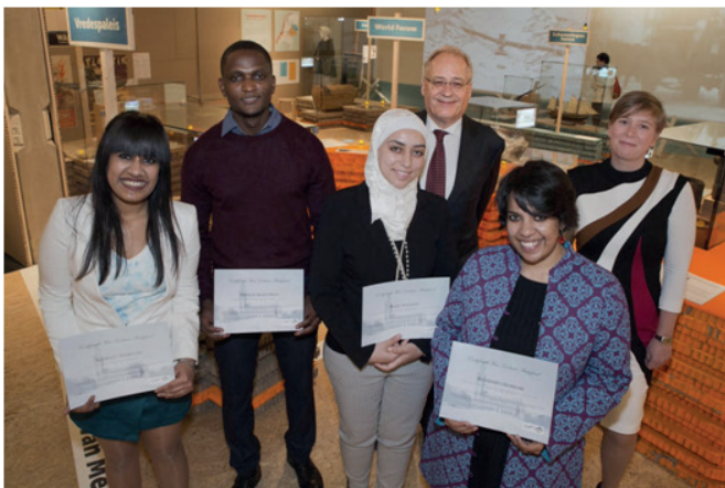
WDS Beneficiaries 2015

"The Wim Deetman Scholarship is the best thing to ever happen to me and I cannot thank the city of The Hague and the former Mayor enough for enabling me to study in one of the best universities in the world. My school fees were paid in full, and the living allowance was enough for my day to day living. I appreciate the life-changing opportunity you offered to me to study at Leiden through the handsome support of WDS."