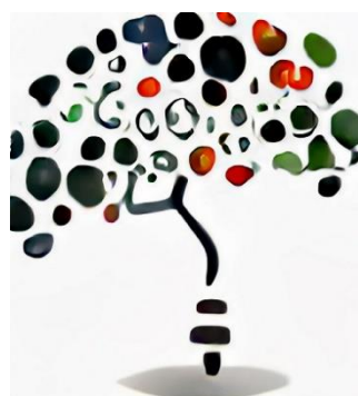
DALL-e image: linguistic data + NLP

Large neural networks trained on enormous amounts of linguistic data are a potentially unprecedented source of linguistic information. But how can we access this information, and use it for testing our theories?