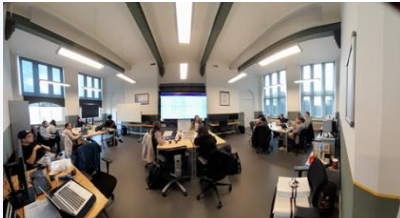
Image: Enrique Manjavacas Arevalo's workshop on 'LLMs in the Humanities'

» Suggestions welcome: 'YourWorkshopSuggestions'