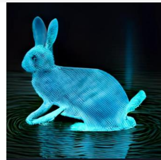
DALL-e image: water rabbit

Best wishes for the New Year! We look forward to bringing you more great digital humanities events in this semester. Register now for our Pilot Projects Symposium on 30 Jan, Digital Skills Winter Week of Workshops 31 Jan - 3 Feb, Special Topics in Dialectology, and upcoming lunch lectures.