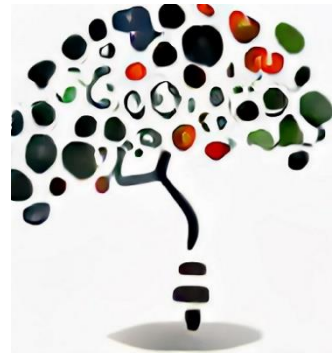
DALL-e image: linguistic data + NLP

Large neural networks trained on enormous amounts of linguistic data are a potentially unprecedented source of linguistic information. But how can we access this information, and use it for testing our theories?