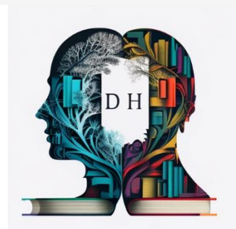
Midjourney image - non-open source