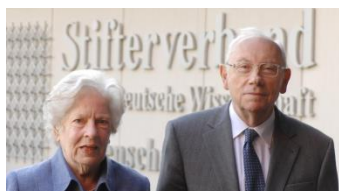
Brigitte und Martin Krause-Stiftung

Made possible thanks to the generous support from