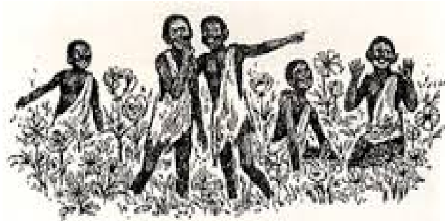
Black pygmy Oompa-Loompas, illustrated by Faith Jaques for the first British edition of Charlie and the Chocolate Factory , 1977