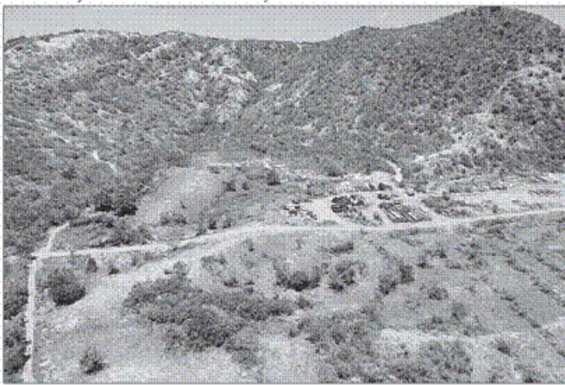
The property where NuStar wants to build a second terminal.