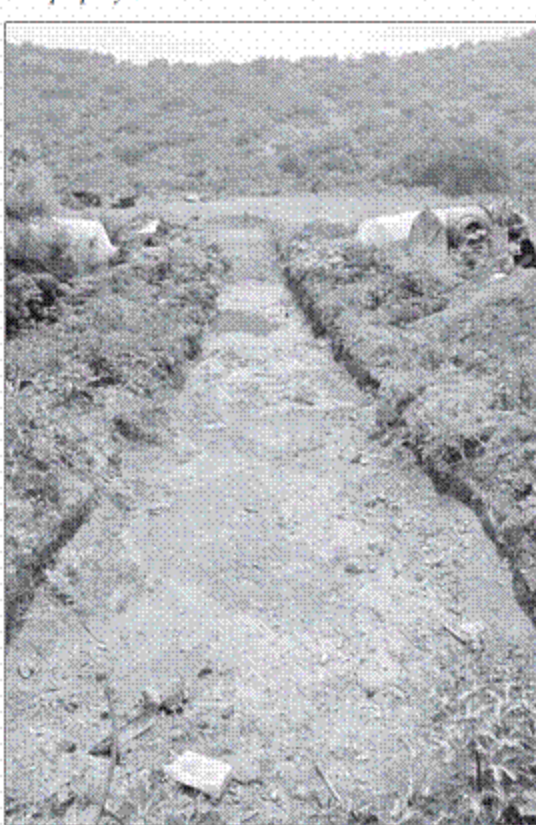
Trenches were dug to facilitate archaeological research.