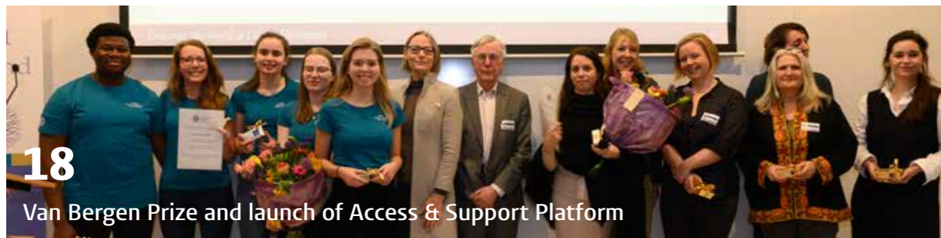
18 Van Bergen Prize and launch of Access & Support Platform